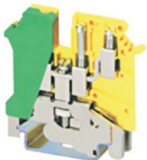
SM C09 UK-2.5-TW-PE