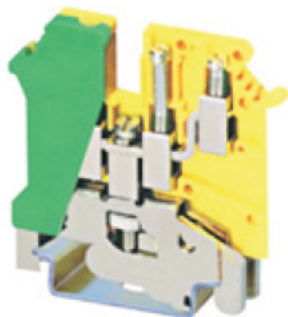
SM C09 UK-4-TW-PE